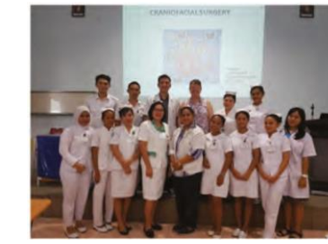
Manado Lecture 1