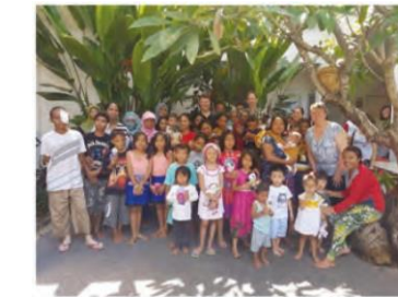
Bali Clinic 2

The Overseas clinics continue to have a positive outcome with the number of patients seen at the outreach clinics and the education exchange for both the medical and nursing staff. Together with the medical support of the ACFU Team, they are able to continue to improve the quality of service delivered to craniofacial patients in Indonesia.