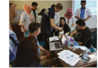
Bali Clinic 1

In the last quarter of 2016 an outreach clinic was held in Denpasar, Surabaya and Manado over a 12 day period from 25 September to 8 October 2016.